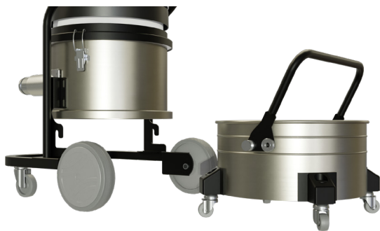
◀ Easy barrel release system