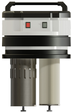
◀ Motorhead with automatic cleaning system ICLEAN