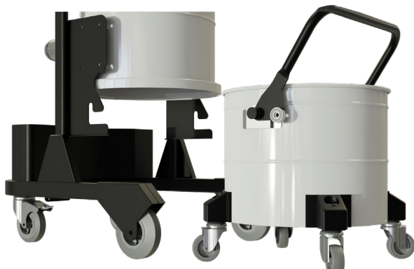
◀ Easy barrel release system