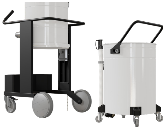
◀ Easy barrel release system