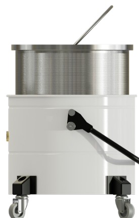
▶ Electric float sensor