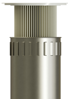
◀ Cartridge filters available with conductive M or HEPA filter media