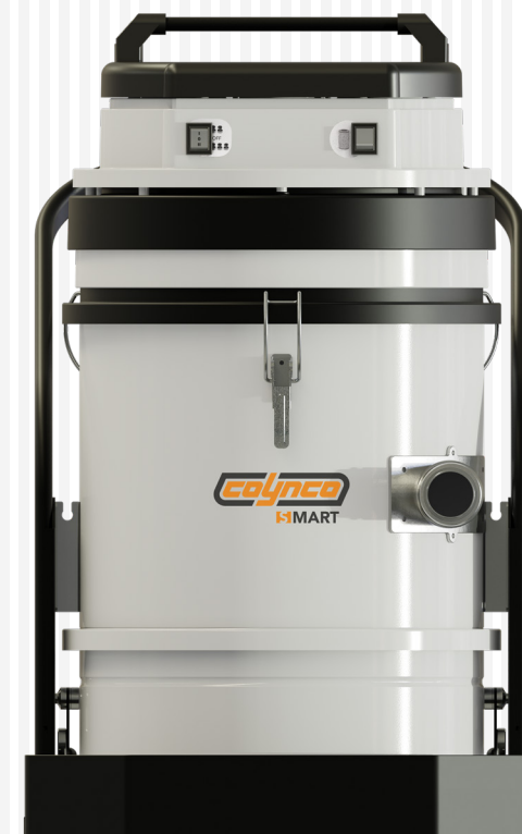
Ingresso di tipo tangenziale ▶