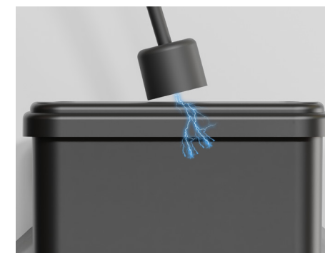
◀ Chip separator bucket