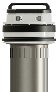
◀ Head with integrated semi-automatic filter cleaning system. Activated by push button.